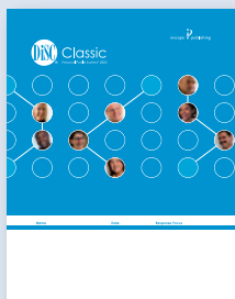
DiSC Classic Paper