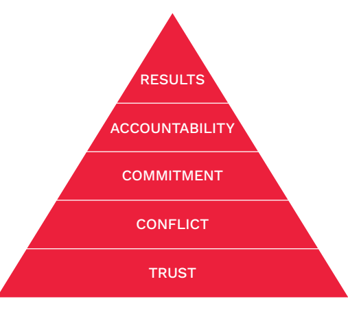
The Five Behaviors Model

The Five Behaviors offers adaptive, research-validated testing through a personality assessment.